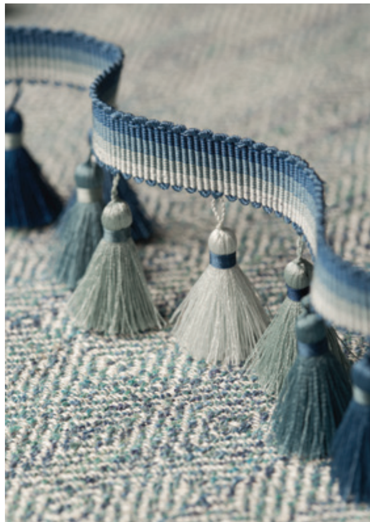
Carolina Ombré Tassel Fringe and Brush Fringe in Maritime