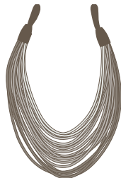
HB-58108 35" (90cm) Carolina Ombré Holdback Available in: Sand, Heather, Robin's Egg, Rosewater, Tuscany, Maritime, Storm