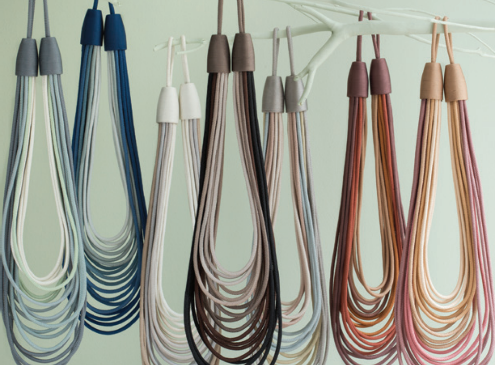
Shown from left to right: Carolina Ombré Holdback in Rosewater, Tuscany, Heather, Storm, Sand, Maritime and Robin's Egg